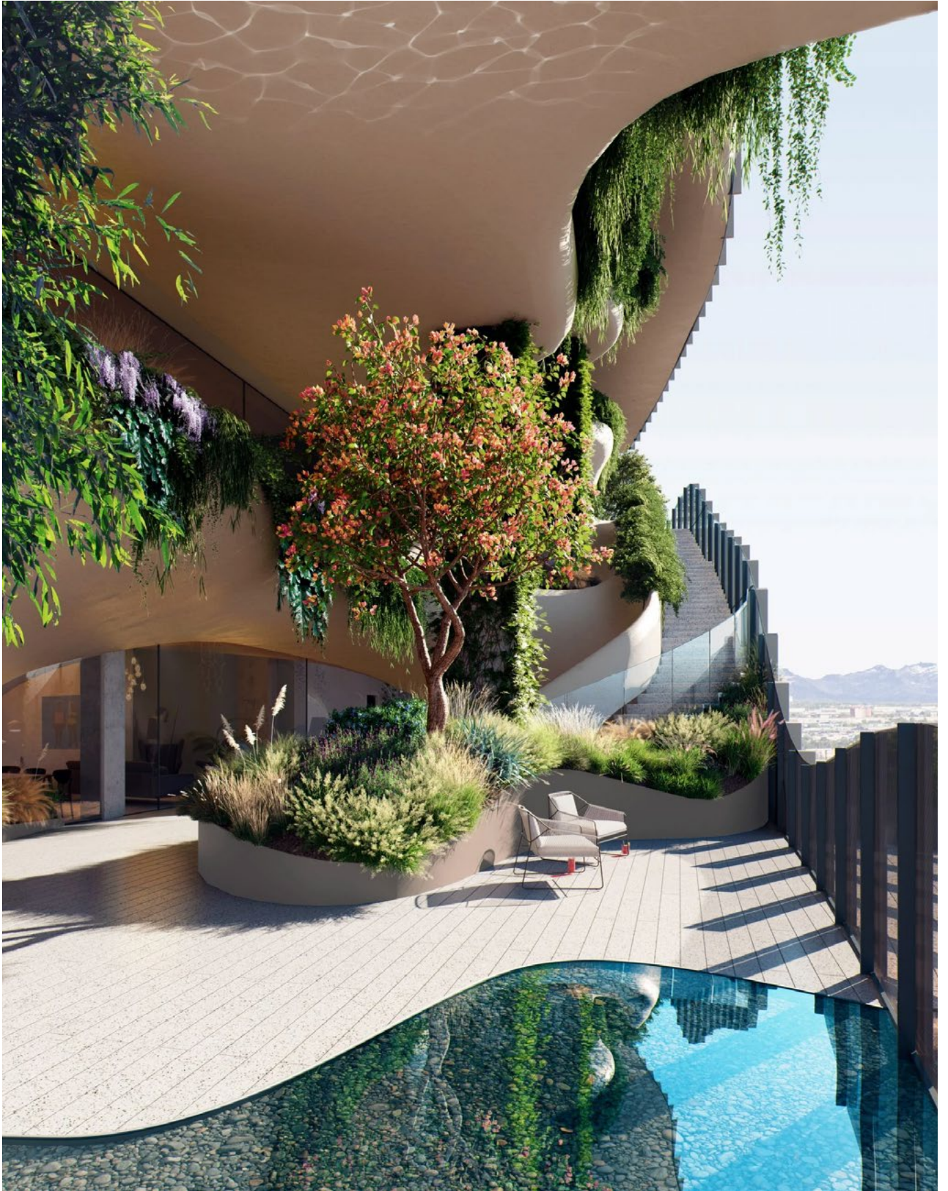
MAD Architects residential tower One River North in central Denver, Colorado with a native plant and water feature canyon cutting through its form, nodding to the state's dramatic topography.