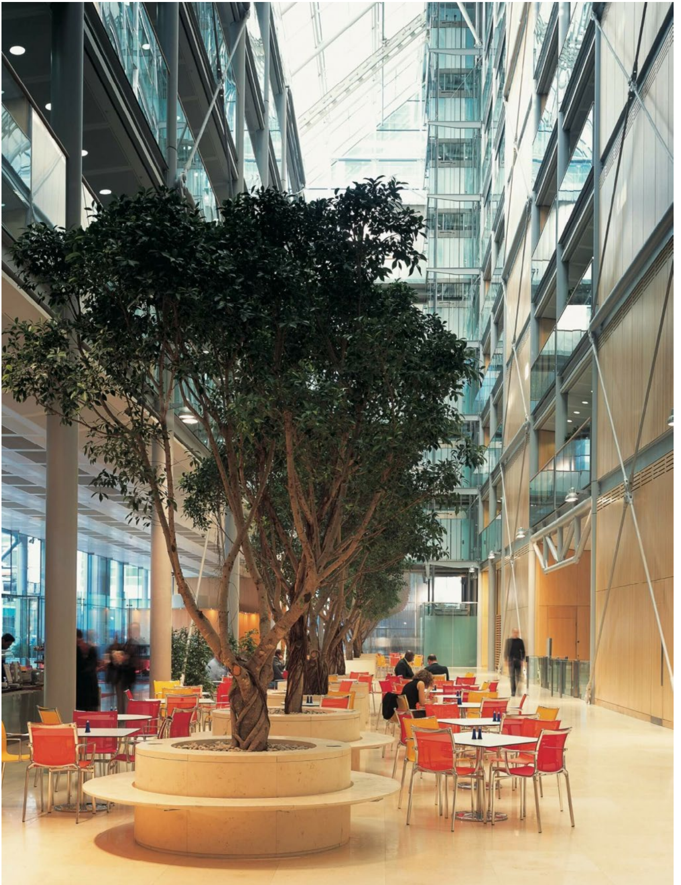
Wellcome Trust HQ, London