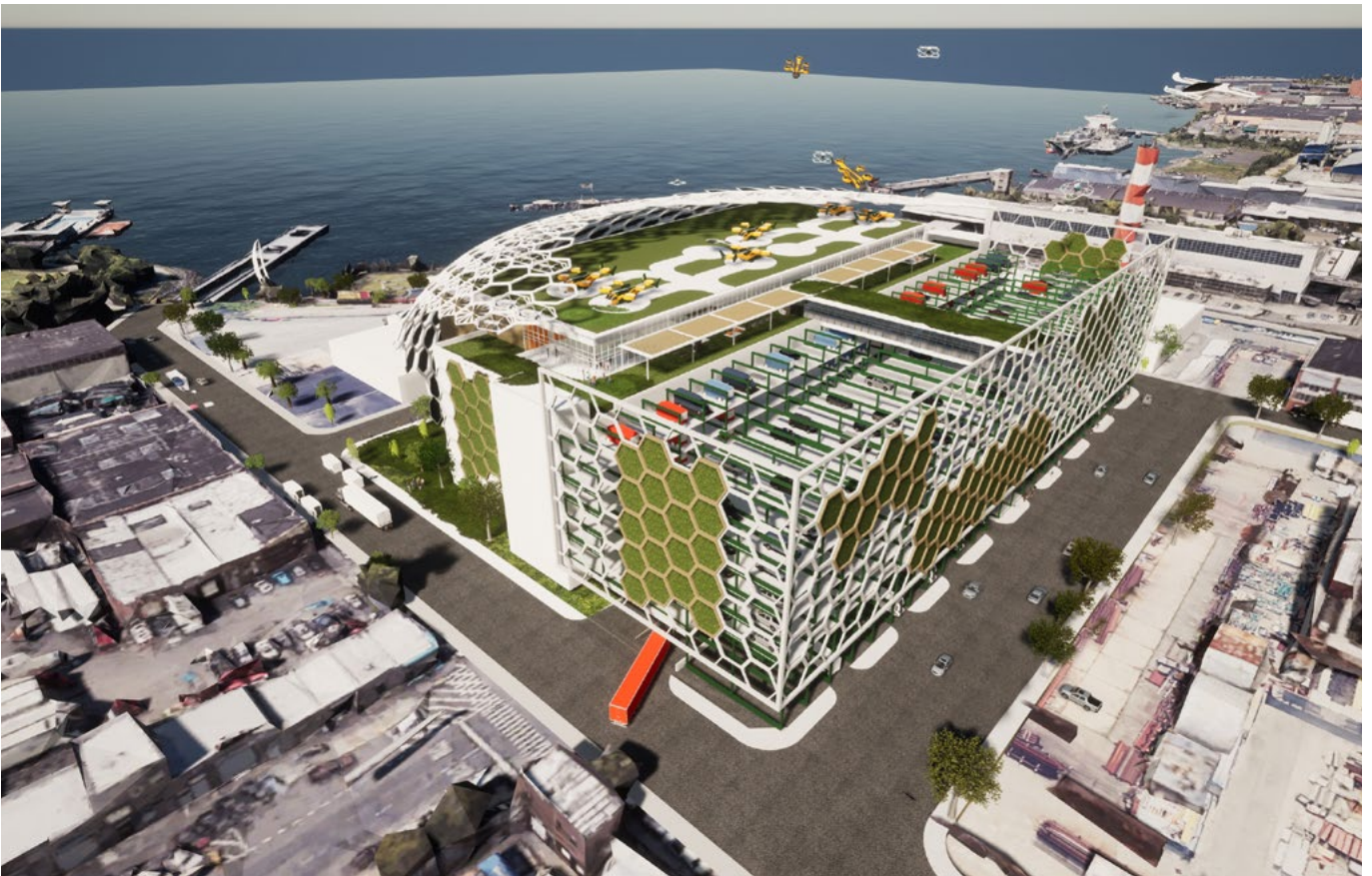
Ware Malcomb, ID3 Concept and the Logistics Building of the Future are both conceptual designs that incorporate sustainable features.